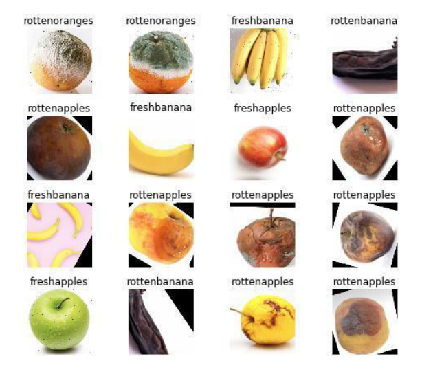
Figure 1. Sample images from the dataset

The dataset used for this study contains images of ripe and rotten fruits- apples, bananas, oranges, pomegranates, mangoes and grapes. These images were of a similar resolution with each of them being rotated by some angle to ensure easier feature extraction.Figure 1 shows a sample collection of images from the dataset. This paper focuses on classifying the fruits in twelve different classes based on multiple features like color, intensity, shape and size. Fruit classification as rotten or ripe has been a hot topic in field of computer vision. [1] study focused on classifying oranges as ripe, unripe or rotten based on decision tree clas-sification. Another study [2] focused on predicting vegetable quality using different segmentation techniques such as color based and edge detection. This study mainly focuses on image classification using Convolutional Neural Networks which resulted in near-to-perfect accuracy which was never achieved before.